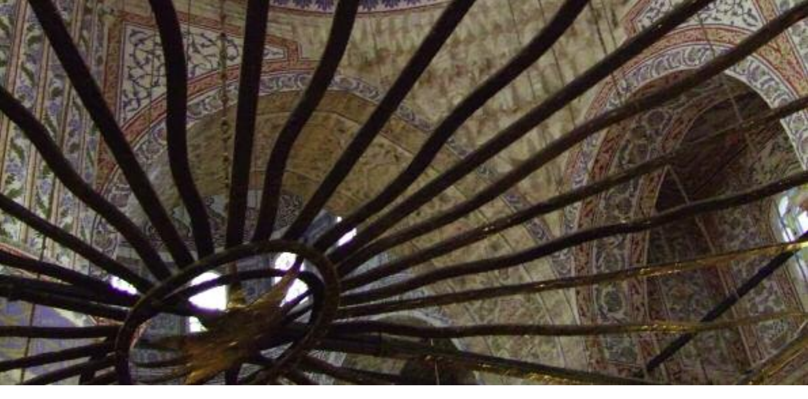
Blue Mosque, Istanbul

Cities: Istanbul(2) Canakkale(1) Kusadasi(2) Pamukkale(1) Marmaris(1) Fethiye(2) Antalya(2) Cappadocia(3) Istanbul(1)