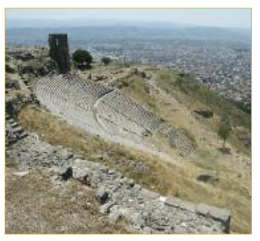
Theatre of the Acropolis, Pergamum

After Breakfast a short drive to visit Ephesus, possibly the best preserved Roman city in the eastern Mediterranean and once the capital city of the Roman province of Asia which at its peak boasted a population of 400,000 people. In ancient times Ephesus was the centre of the cult of Artemis/ Cybele, the Anatolian Mother Goddess