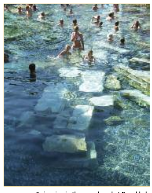
Swimming in the sacred pool at Pamukkale