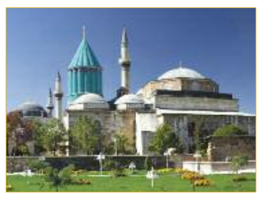
Mevlana monastery, Konya

After breakfast full day excursion in Cappadocia including visits to the Kaymakli Underground City, Open Air Museum in Goreme and natural fortress in Uchisar. You have the option of a Turkish folklore in the evening. Overnight in Cappadocia. (B,D)