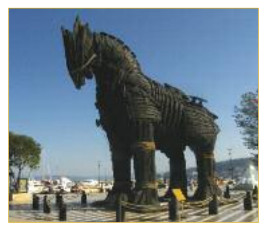
The legendary Trojan Horse

After breakfast we depart for the legendary City of Troy, the site where the Trojan War took place. Of all the ancient sites in Turkey, Troy is probably the one that captures western imaginations the most yet the site is not large and as much as anything is an object lesson in how the methods and purposes of archeology have changed since the original excavator Schliemann, with his buccaneering methods, literally plundered the site in a massive exercise in profiteering and self publicization in 1871.