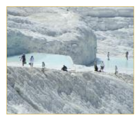
Calcite deposits at Pamukkale

After Breakfast we head eastwards along the plain of the Meander River famous for its cotton plantations, figs and for sultanas, which come from and are named for, the Sultan Mountains along the southern edge of the plain. We will visit Hierapolis and Pamukkale. Famous today for the calcite deposits which look like frozen cascades of water, ancient Hierapolis was once a health spa renowned throughout the ancient world for the treatment of many ailments but especially allergies and skin complaints. The importance and wealth of this ancient city is clear from the impressive remains scattered up the hill behind the calcite Travetines although the profusion of important tombs in the city's necropolis does make one wonder about the efficacy of the treatments on offer in ancient times. However, people still visit to take "the cure" at the ancient