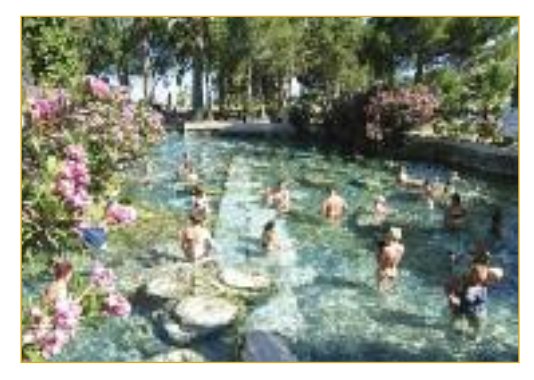
Bathing in the sacred pool, Pamukkale

After breakfast we will visit the stunningly beautiful Saklikent Gorge, Turkey's longest and deepest canyon; Saklikent means "Hidden City" in Turkish. After tracking along the canyon we will