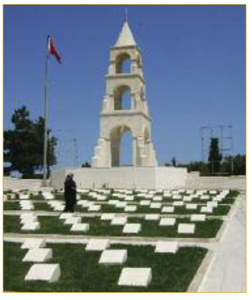
Monument to the Turkish 57th regiment