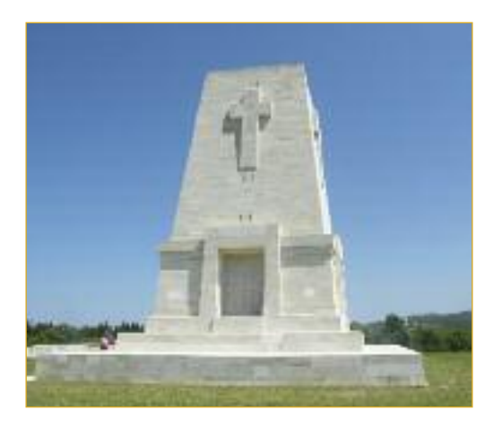
Lone pine monument

After breakfast at the hotel, we drive along the north coast of the Sea of Marmara to the Battlefield sites of Gallipoli and visit monuments at Anzac Cove, Nek, Conk Bair, Lone Pine and 57.th regiment memorial with a final stop at the new War Museum. Gallipoli- in Turkish Gelibolu- was the site of allied landings on the 25th of April, 1915 by French, British Empire and Commonwealth troops which intended to force the Dardanelles and gain naval access to Constantinople. It is a place that saw the awakening of a national consciousness amongst not just Australians and New Zealanders but also Turks, because it was here that Mustafa Kemal, later Ataturk, founder of the Turkish Republic, first came to national prominence. Gallipoli is a moving place to ponder the terrible war that wracked the civilised world between 1914 and 1918 but more than that, it is today a tranquil place of pilgrimage for Australians, New Zealanders, British and Turks and it is a monument to the ideals