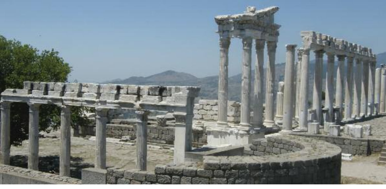
Pergamum, the temple of Hadrian

This is a complex multi layered site that covers not just the "Trojan War" but 3000 years of human habitation in at least 9 levels which our expert guides will bring to life. Apart from the archeology, what really inspires the imagination is Homer's "Iliad" and indeed this is what drew Schliemann to this site in the first place; the legendary Trojan Horse is reconstructed at the entrance of the city while the wooden horse that was used in the making of the eponymous Hollywood blockbuster takes pride of place on the water front in the nearby port of Canakkale.