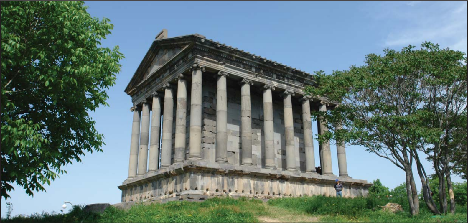
Pagan Temple at Garni: 1st century AD