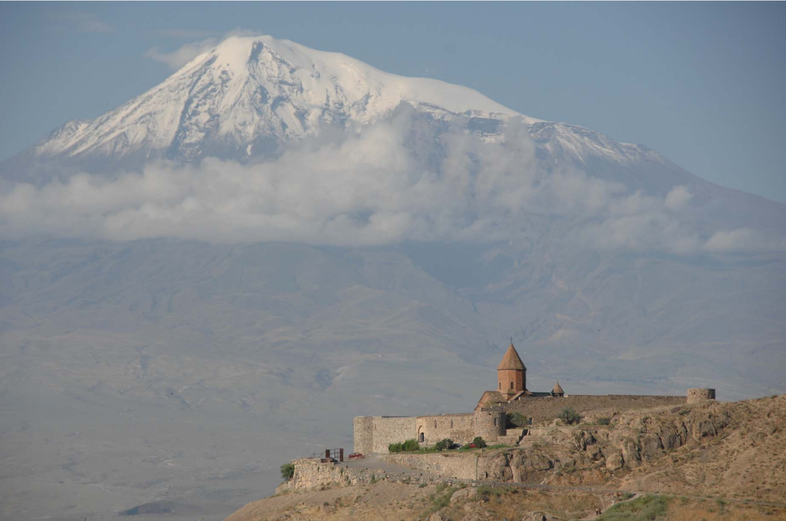
Khor Virap monastery and Mt. Ararat