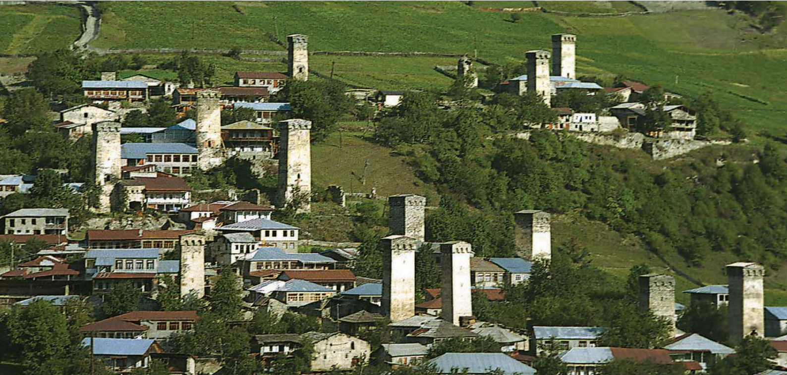
The Legendary Towers of Svaneti