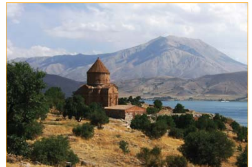
Akdamar Island on Lake Van

Arrive in Van. Orientation in the hotel with your Turkish team and an opportunity to get to know your fellow travellers. Lunch in hotel. After lunch we will travel by coach the short distance to Van Castle with its 3,000 year old Urartian citadel, graced by a massive inscription placed there by the Persian King Xerxes, Van Castle is a place of history, atmosphere and beauty. Sunset over Lake Van viewed from the citadel is a stunning way to close the first day of your exciting tour of Eastern Turkey, Georgia and Armenia. (L,D)