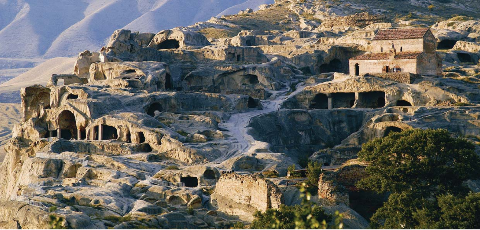
Uplistsikhe Cave City