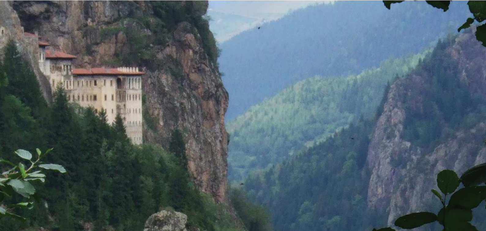
The Monastery of the Virgin Mary at Sumela