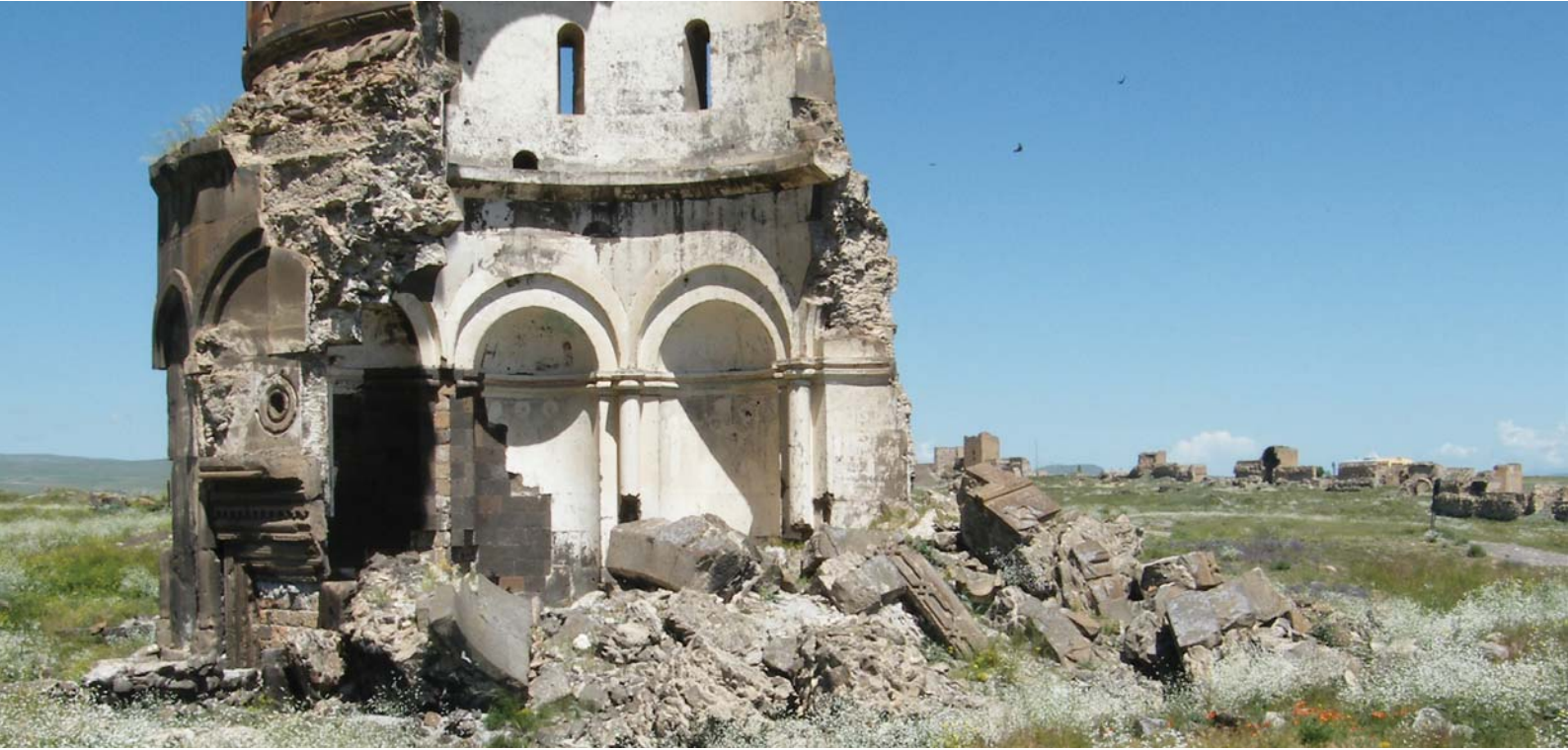
Church of the Redeemer with the city walls in the distance