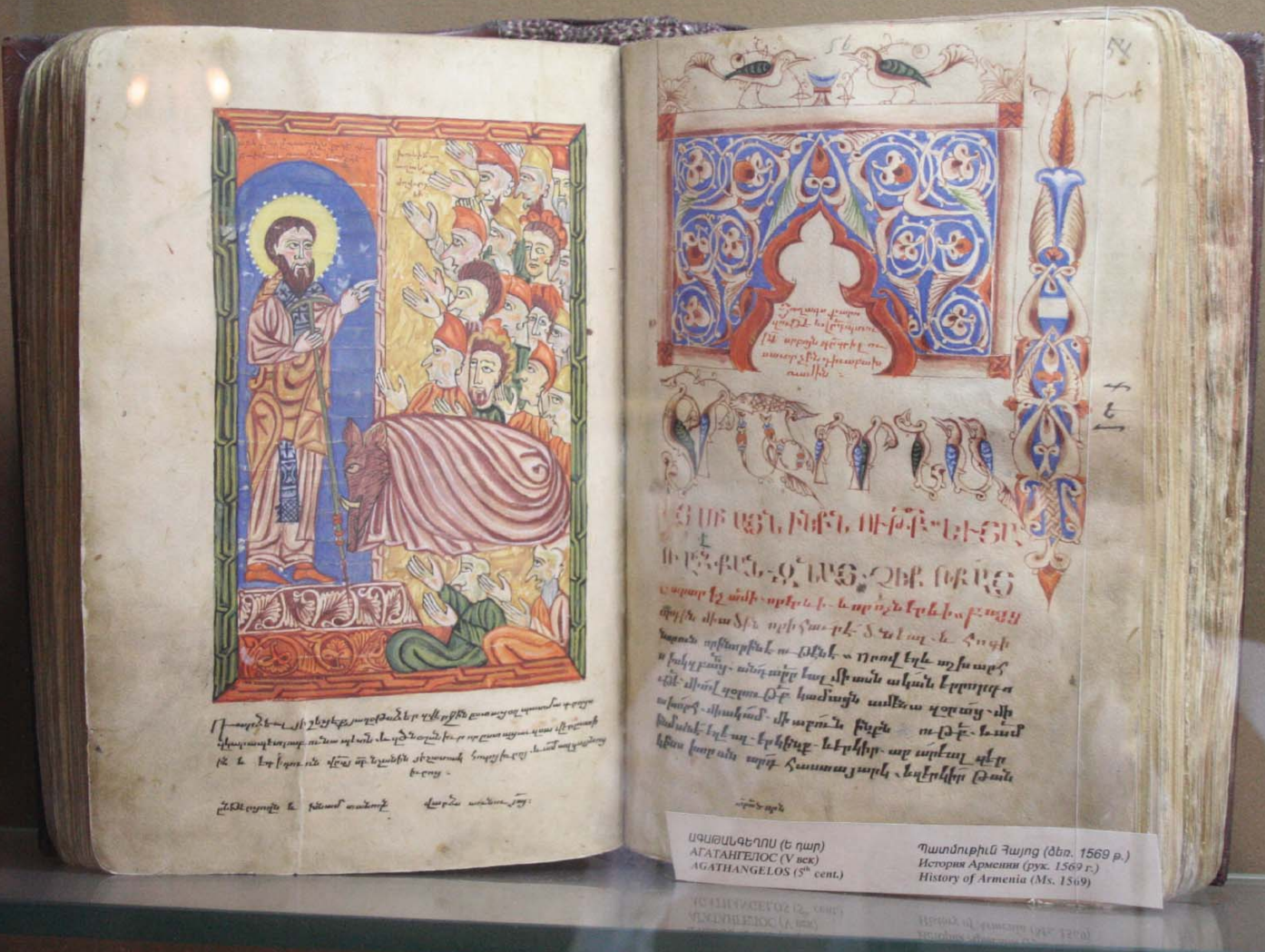
The Matenadaran Documents