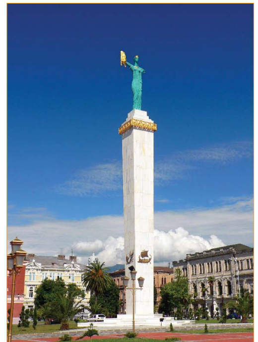
Batumi: Media holding the Golden Fleece aloft.

The Black sea coast of Georgia is the legendary land of Colchis where the Golden Fleece was kept. The Golden Fleece, stolen by Jason and his Argonauts with the help of Media, is celebrated in this statue in Batumi.